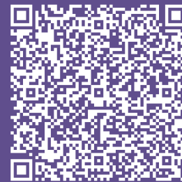
Scan to book a room